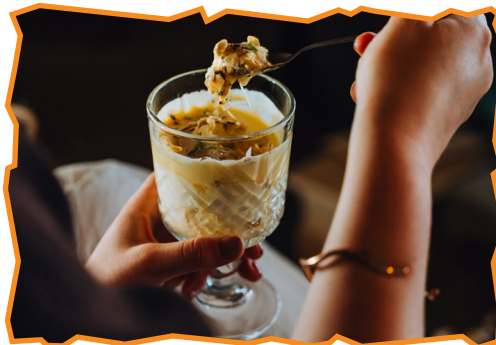
Table dining (tip)